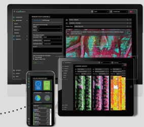
Your CultivateAI Dashboard

CONFIDENTIAL INFORMATION: This document is strictly private, confidential and personal to its recipients and should not be copied, distributed or reproduced in whole or in part, nor passed to any third party.